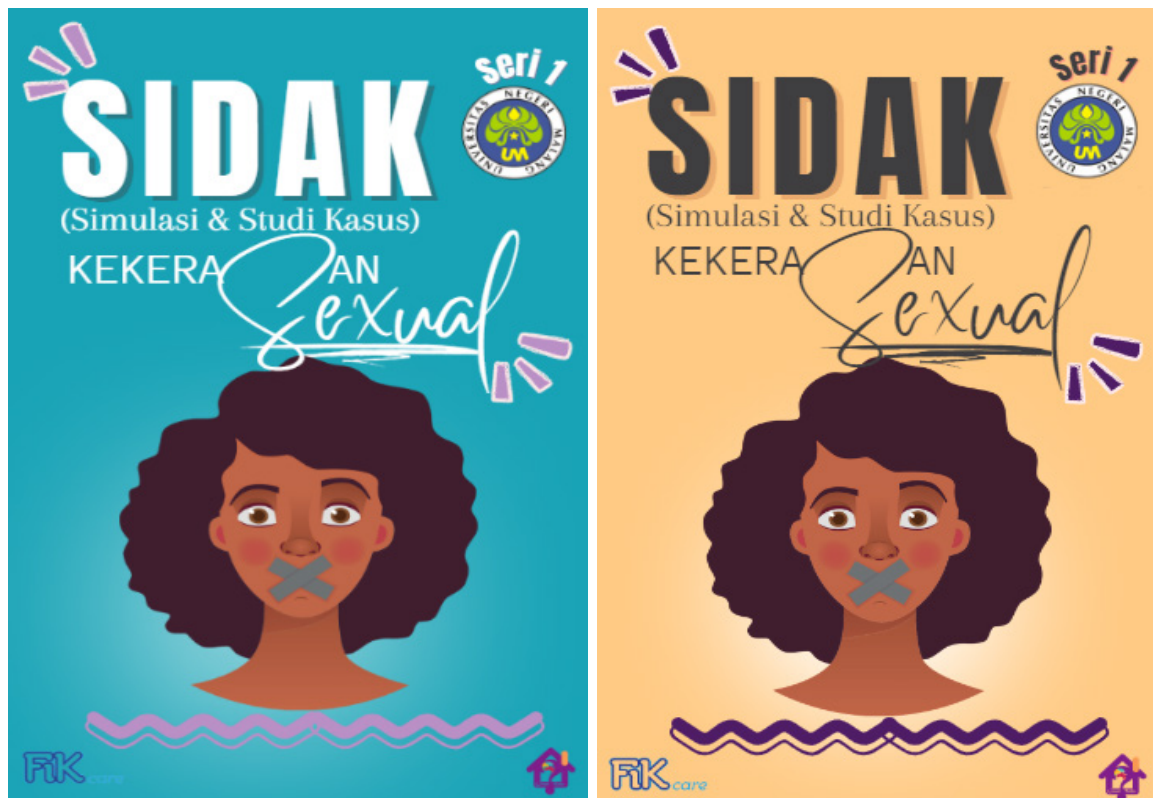
Figure 2. Design front cover of flashcards